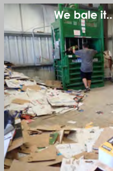
We bale it...