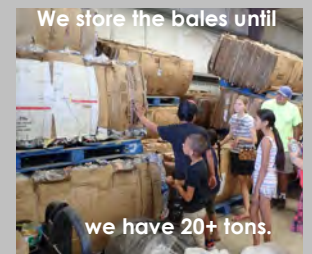
We store the bales until