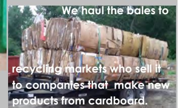
We haul the bales to recycling markets who sell it to companies that make new products from cardboard.

No—Our cardboard does not go to the landfill.