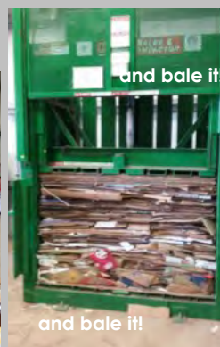
and bale it!