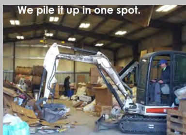
We pile it up in one spot.