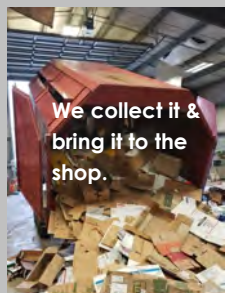
We collect it & bring it to the shop.