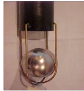
Flow restrictor (ball float valve)

If a tank is overfilled, product could be forced through the vent line and other loose tank fittings, potentially resulting in a damaging and costly release into the environment. Properly functioning overfill prevention will significantly reduce the chance of an overfill release.