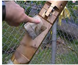
Automatic shutoff device with damaged float