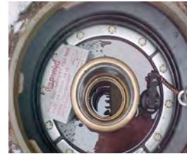
Looking down the fill pipe at the flapper valve

The automatic shutoff device is located in the drop tube within the fill pipe riser.