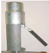
Automatic shutoff device (flapper valve)