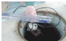
Manually checking brine sensor