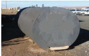
Steel tank with sacrificial anode

Keep records of system installation, triennial testing, integrity assessments, and repairs to help determine whether your system is in compliance with the corrosion protection requirements.