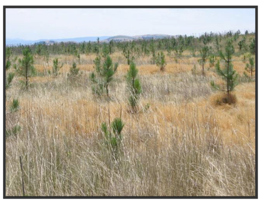
Nez Perce Post Hole Project - 5 years later

The balance of the total acreage, contained in the other portfolio, has not yet been sold or committed. As these forests grow and continue to sequester carbon, and if early action credits are included in national legislation, and if subsequent sales are made, the tribe will then use this revenue to reimburse other programs for the implementation costs of the initial project and use the remainder of the revenue to replicate the project.