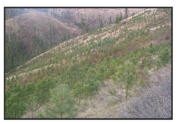
Nez Perce Tramway Project - After

The Nez Perce Tribe has encountered many challenges in dealing with the complex and evolving markets for forest carbon offsets. Overall the initial challenge of learning and understanding the terminology and convoluted process required to engage in carbon offset markets, as well as identifying partners and resources was daunting and required a lot of time and commitment. The uncertainty within the United States and lack of federal legislation on climate change has reduced the current value of carbon and the willingness of the tribe to invest in carbon offset projects.